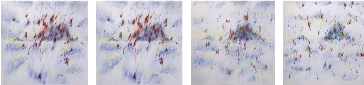
The Skellig Seen From The Mainland Under The Veil Of Mathematics 2 A-D, 2022/23, Pencil On Paper, 298mm x 1090mm

Outhere has series of studio drawing & watercolours of and around the island. Everchanging light signifying historical propulsion independent of action.