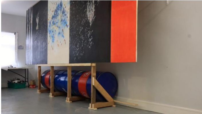
The Mathematical Equation Hidden in The Contours of The Skellig Defining Ireland Not found, 2015-2023, (Side/Reverse).