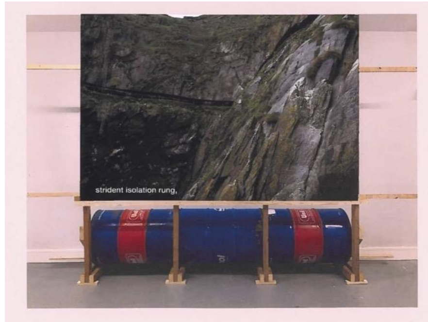
The Mathematical Equation Hidden in The Contours of The Skellig Defining Ireland Not Found, (Reverse/Screen) Timber, Oil Drums, Canvas Sailcloth, Rope, 2660mm x 4790mm x 660mm, 2015-2023

A Mariner rows out into the Atlantic to uncover the mathematical equation hidden in the contours of the Great Skellig. He must go sufficiently beyond the Rock to be able to see the numbers, he believes, hidden. In his eagerness to find answers he gets lost at sea. The film is his telling of the journey.