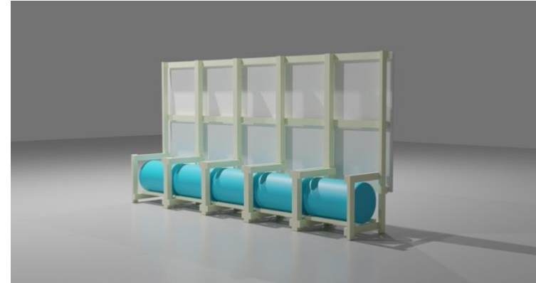
Visual imagining By Alex Jackson.

The painting, The Mathematical Equation Hidden in The Contours of The Skellig Defining Ireland Not Found , cuts the exhibition in two. The front of the painting is well lit, as is the surrounding half, which also contains drawings and watercolours. The back of the object, by contrast, is unlit and dark, illuminated only by the projection of the film Outhere onto a sailcloth fixed by rope to the structure.