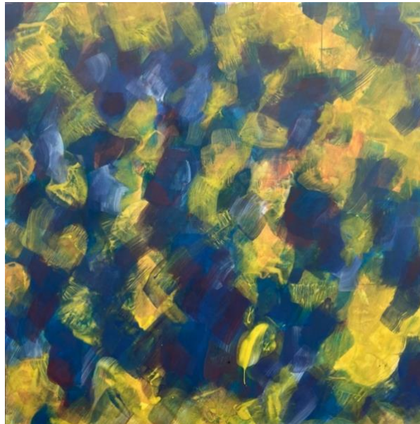
Reflets dans l'eau 2, 2023 Watercolour on Paper, 300mm x 300mm