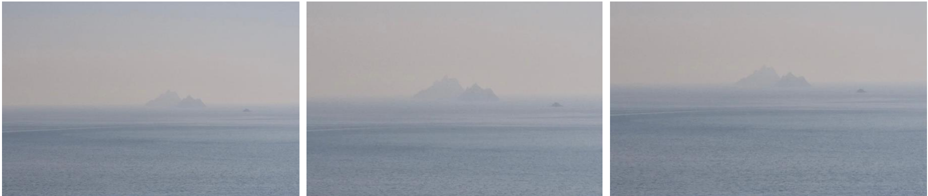
Sequence from Outhere : 30min HD Single Channel, 2023

Outhere is a combine exhibition of moving image, drawing, painting and structure. The premise is one where the artist, (in performative persona), leaves the mainland of his native county, rows out beyond the Great Skellig to uncover the mathematical equation, he believes, is hidden in the contours of the islands. Once deciphered, he is convinced this equation will define Ireland. The failure of his journey is the interest.